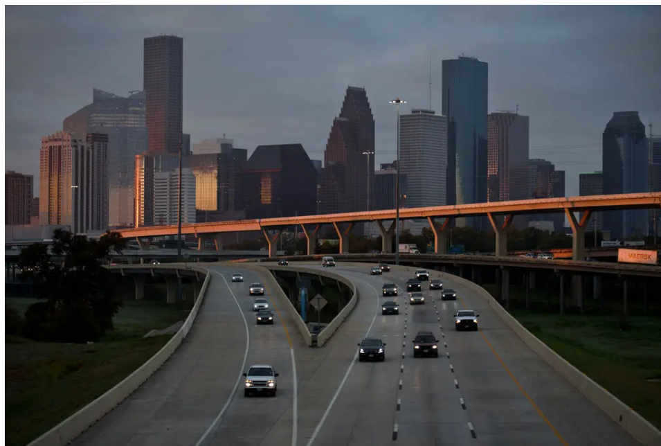
For states, the chances of getting more federal money from a discretionary fund will depend on whether the projects address racial equity.