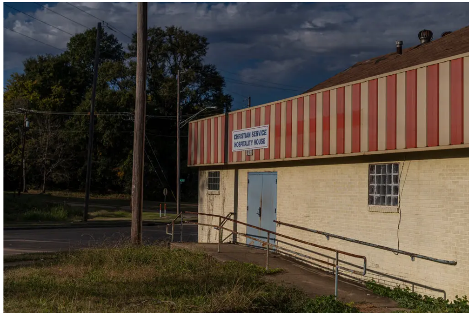
A plan to expand Interstate 49, which has been delayed for years and is undergoing an environmental analysis, would cut through the community of Allendale in Shreveport, La.