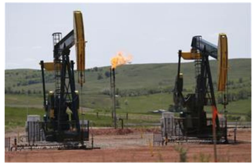
Oil pumps and natural gas burn off in Watford City, N.D.

By John Johnson , Newser Staff Posted Sep 11, 2018 7:47 AM CDT f t e 124 comments